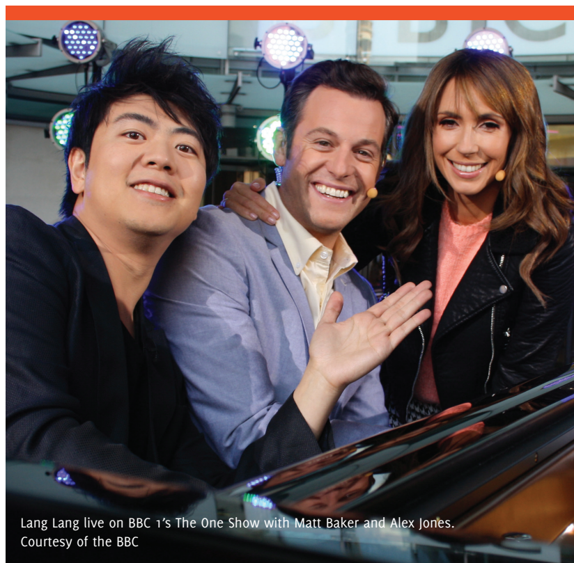
Lang Lang live on BBC 1's The One Show with Matt Baker and Alex Jones.